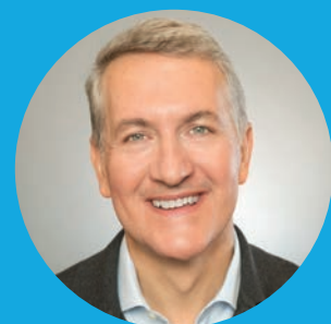
Sincerely, Ramon Laguarta Chairman and CEO PepsiCo

By taking the time to read PepsiCo's 2018 Diversity Report, you are helping us advance this critical mission. As we continue the work of building a stronger, more diverse company, we are fortunate to have allies like you. Together, we can ensure that PepsiCo remains a company of opportunity for years to come, while also working to accelerate growth and gain ground against our competitors in markets around the world.